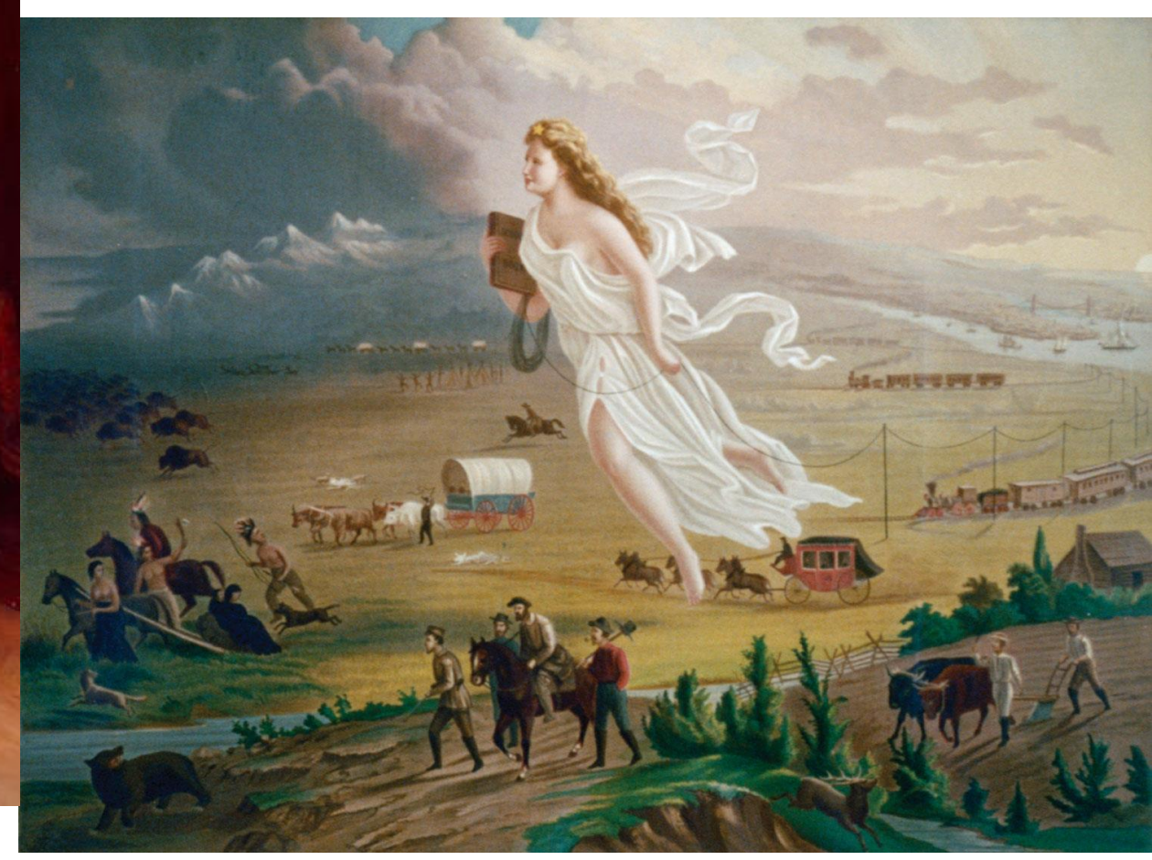
American Progress by John Gast (1872)