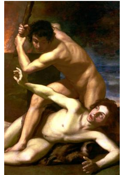
'Cain Murdering Abel,' Bartolomeo Manfredi, c. 1610

Whatever its causes, the implications of the historical decline of violence are profound. So much depends on whether we see our era as a nightmare of crime, terrorism, genocide and war or as a period that, in the light of the historical and statistical facts, is blessed by unprecedented levels of peaceful coexistence.